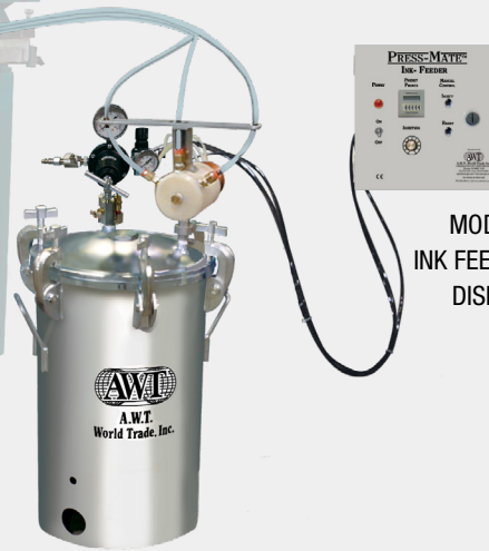
MODEL PM-5A SHOWN INK FEEDER WITH AUTOMATIC DISPENSING CONTROL