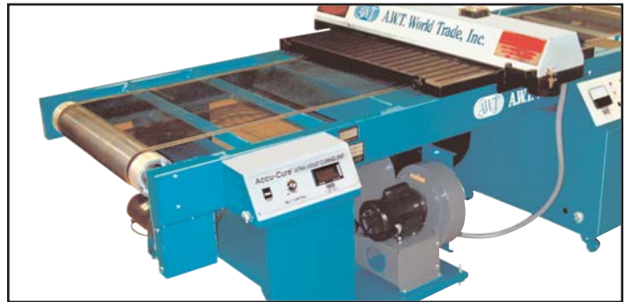
Flat substrates and rigid panels are transported efficiently on a strong Fiberlon™ conveyor belt. Belt is heat resistant up to 500 F.