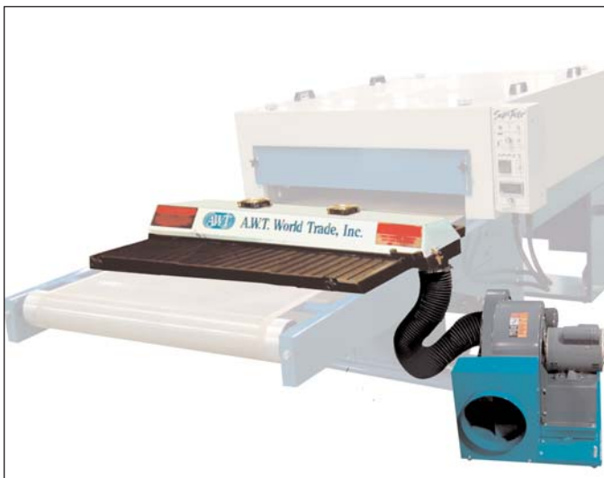
Existing dryer retrofitted with A.W.T. Curing Head.

To retrofit your existing dryer with A.W.T.'s UV Curing Head, simply order one of the units from the chart at the right. Note: Units do not include vacuum hold-down or exhaust system.