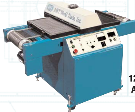
12" Small Format Accu-Cure