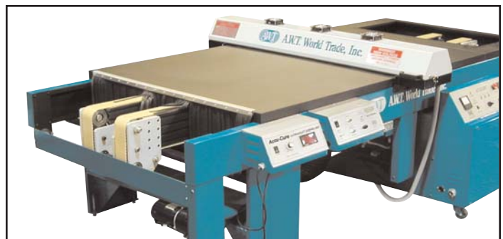
3-Dimensional parts are transported efficiently on specially-designed, recessed conveyor belts.