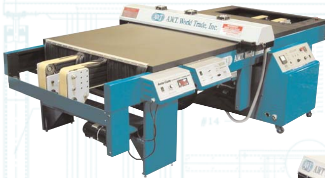
Accu-Cure with 3D Parts Conveyor