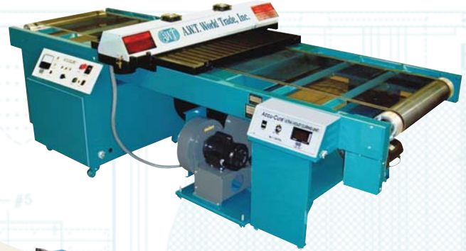
Accu-Cure with Standard Conveyor