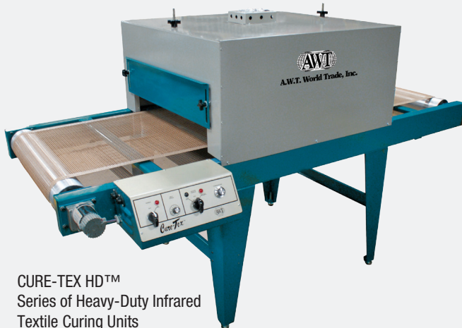
CURE-TEX HD™ Series of Heavy-Duty Infrared Textile Curing Units