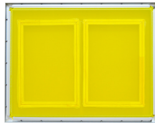
Stretch-Lok™ Manual Stretching System