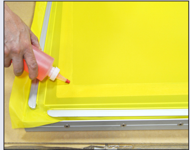
Applying Liquid Seal to bond fabric to frame. Mesh is stretched on A.W.T.'s Stretch-Lok™ manual screen stretching system.