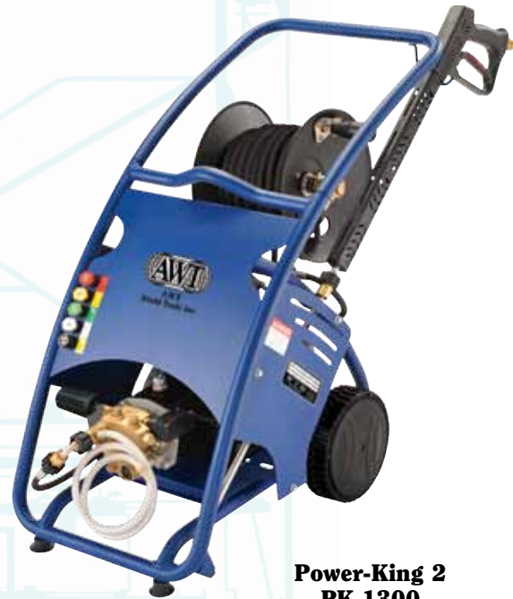
Power-King 2 PK-1300