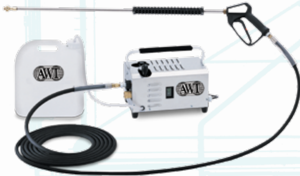
Power-King 2 PK-1200