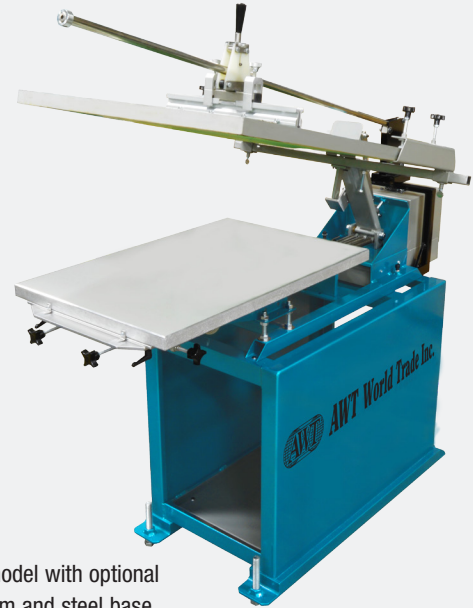
Floor model with optional print arm and steel base