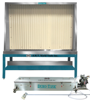
Kleen-view Washout Sink & Duro-tank Recirculating System