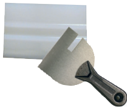
Scrapers & Coaters