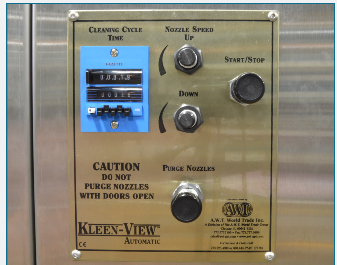
From the convenient control panel, the operator can start/stop cleaning operation, view cleaning time, increase or decrease the nozzle speed and even purge any water remaining in the nozzles.